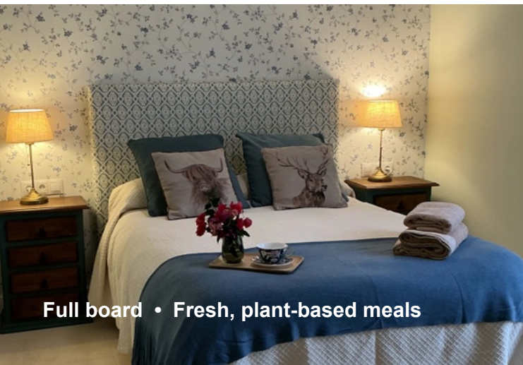
Full board • Fresh, plant-based meals